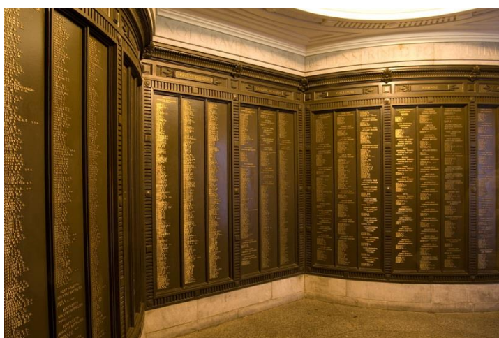
National War Memorial – Adelaide