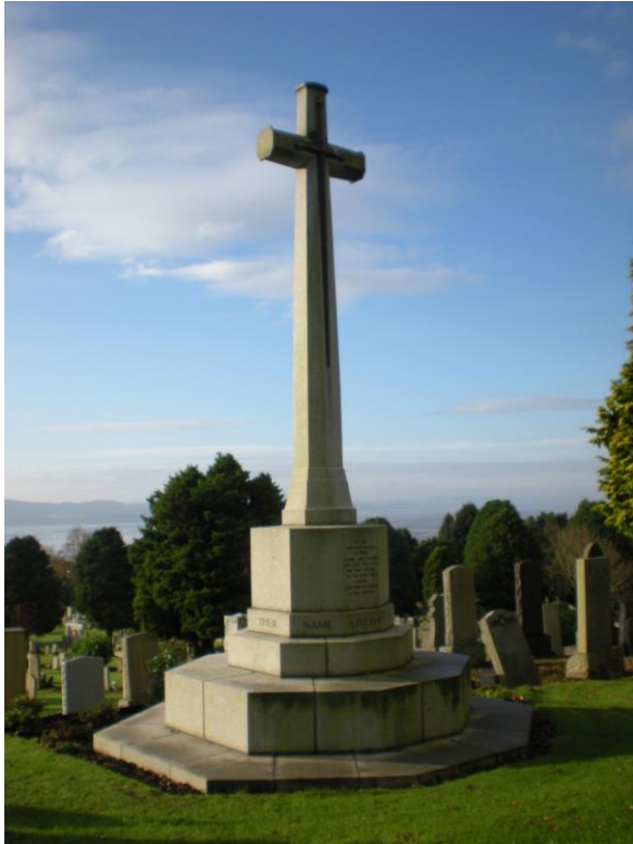
The Cross of Sacrifice at Balgay Cemetery, Dundee

There are now nearly 150, 1914-1918 and nearly 130, 1939-1945 War casualties commemorated in this site. The Polish Group plot contains a special memorial, commemorating a Polish soldier buried elsewhere in the cemetery. (Information from CWGC)