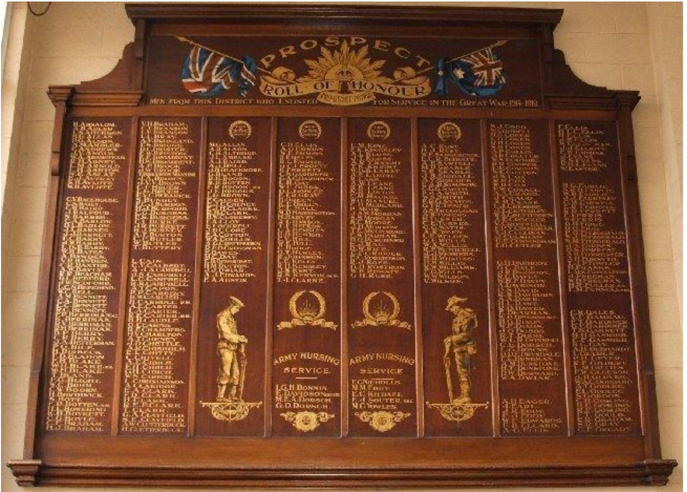
Prospect RSL Hall Honour Board WW1 (A – G)