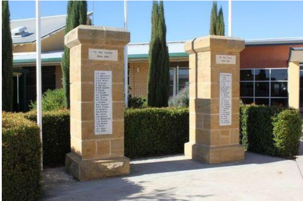
Memorial Arch Gates, Murray Bridge