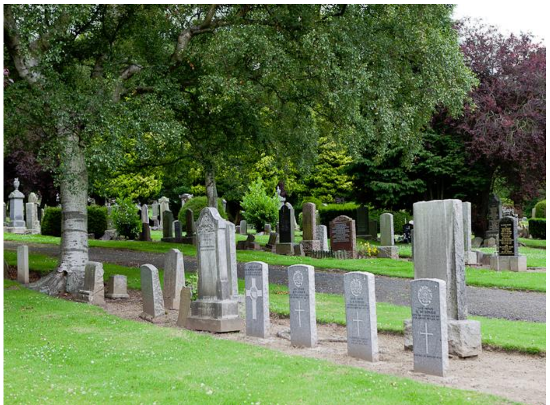
CWGC Headstones of the Three Australian Soldiers